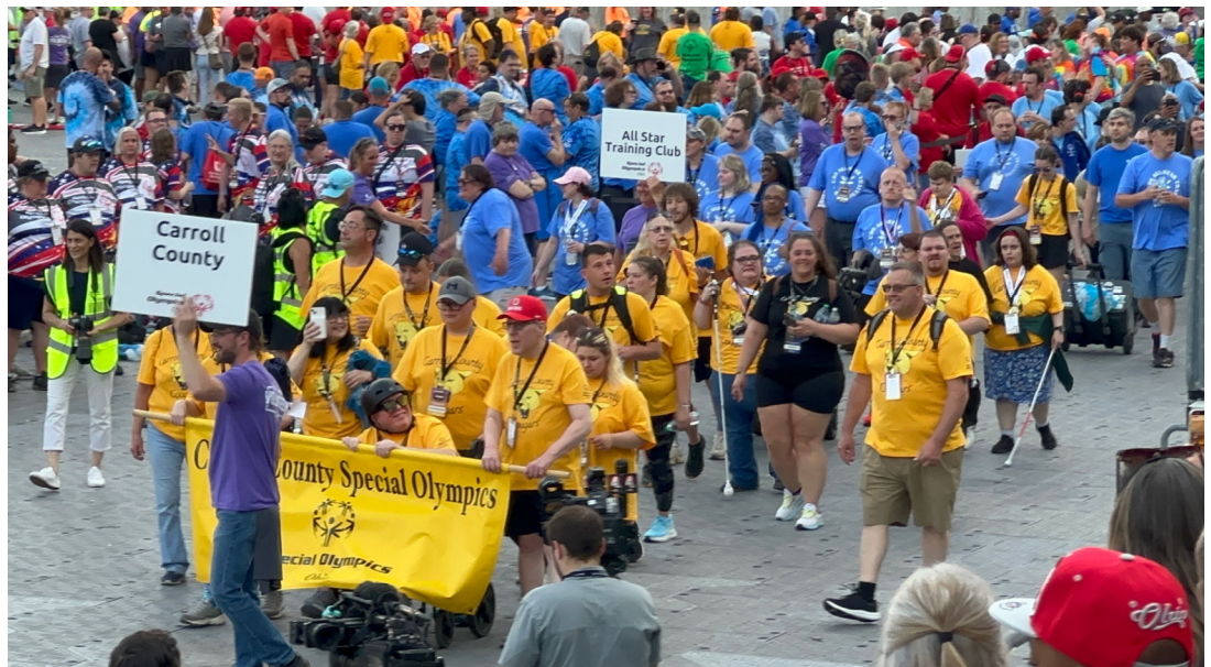
Carroll County Special Olympics Athletes in the Opening Ceremonies Parade.

The Special Olympics Ohio State Summer Games took place May 29–31, 2026, held at The Ohio State University in Columbus. This premier event features nearly 3,000 athletes competing in sports such as track and field, bocce, bowling, gymnastics, powerlifting, tennis, and volleyball.